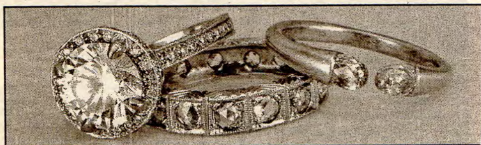
Micro Pave ring, Rose Cut diamond eternity band and Briolette ring.